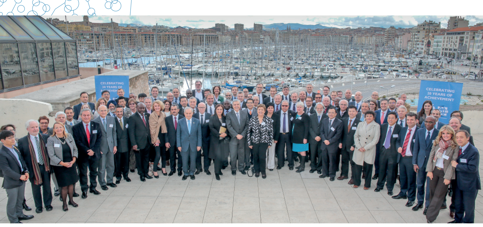
Over 140 World Water Council Governors and members took part in the 60th Board of Governors meeting in Marseille, France, 25–26 November 2016

Report to the 61st Board of Governors meeting